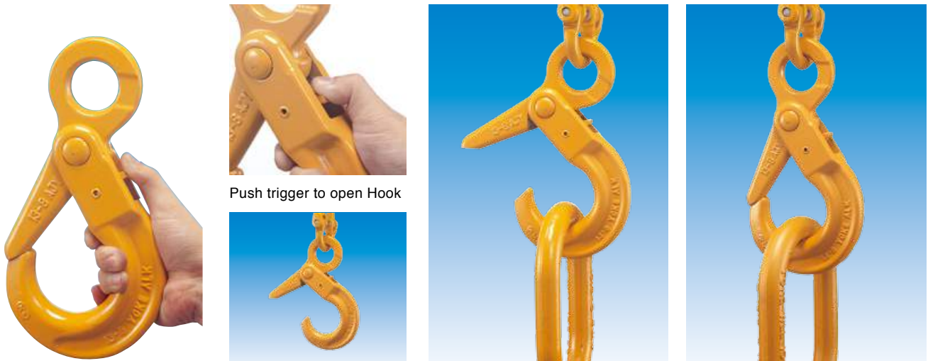
Push trigger to open Hook